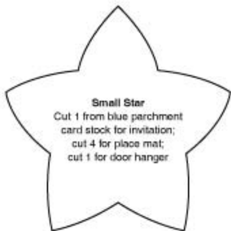
Small Star Cut 1 from blue parchment card stock for invitation; cut 4 for place mat; cut 1 for door hanger